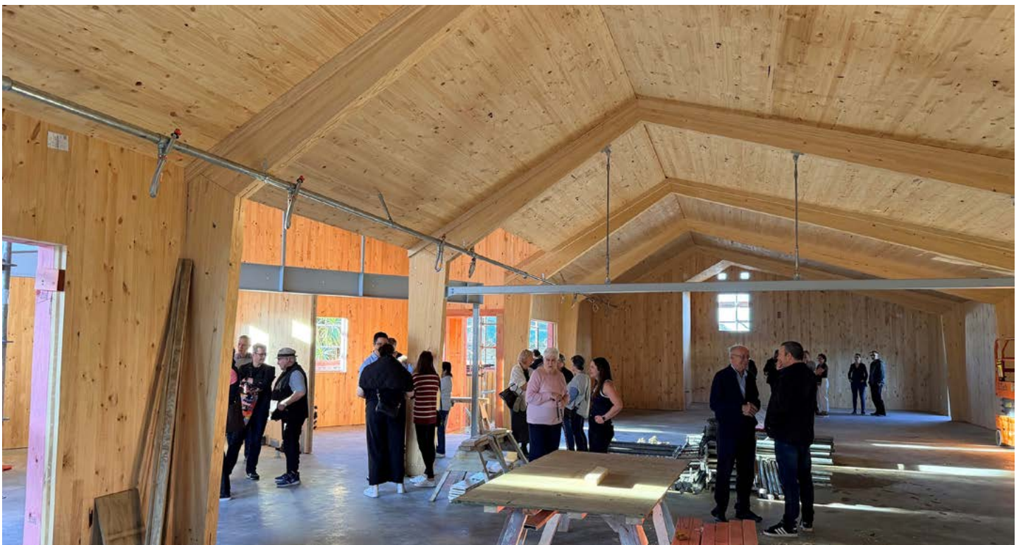
Inside the new Woolston Band Room.