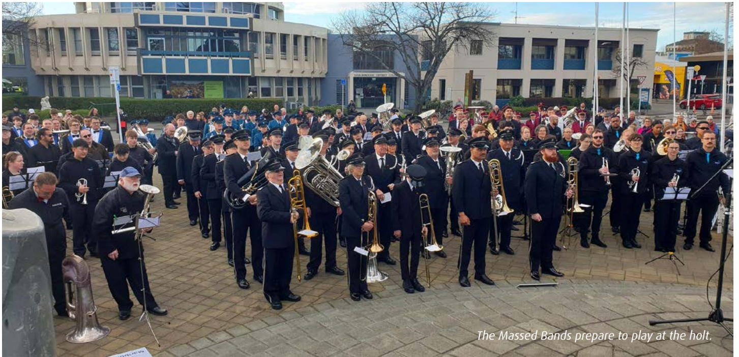
The Massed Bands prepare to play at the holt.